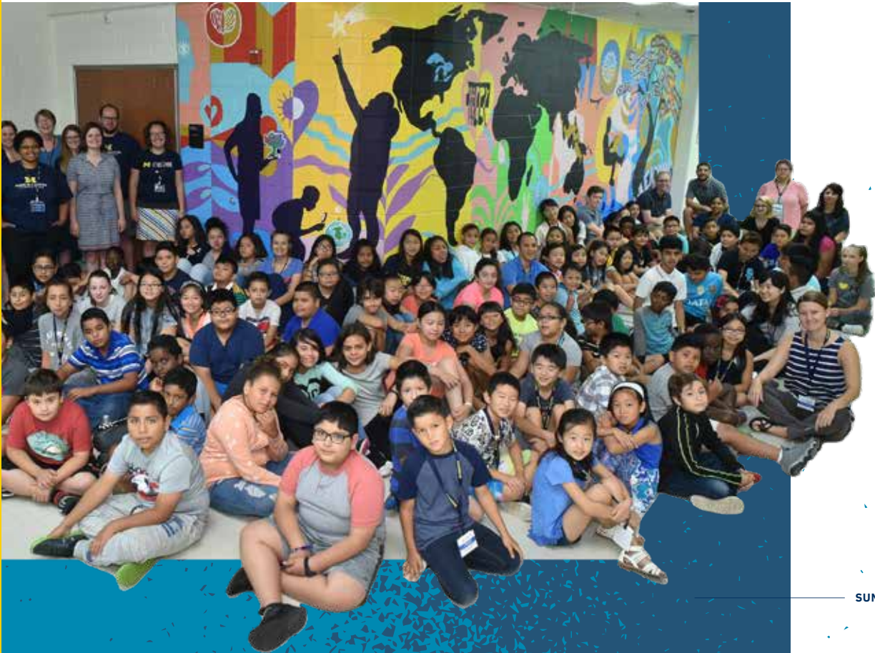
SUMMER ESL ACADEMY

As Michigan's longest-running state-approved alternative route to certification program, M-ARC includes three program pathways open to candidates from across the state.