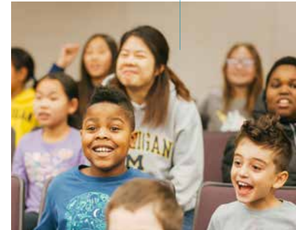
ANNUAL MLK DAY CHILDREN & YOUTH PROGRAM

Students, faculty, and staff have organized the events you see here. Each year, new programs and events are introduced based on the interests of our community members.