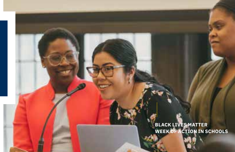
BLACK LIVES MATTER WEEK OF ACTION IN SCHOOLS