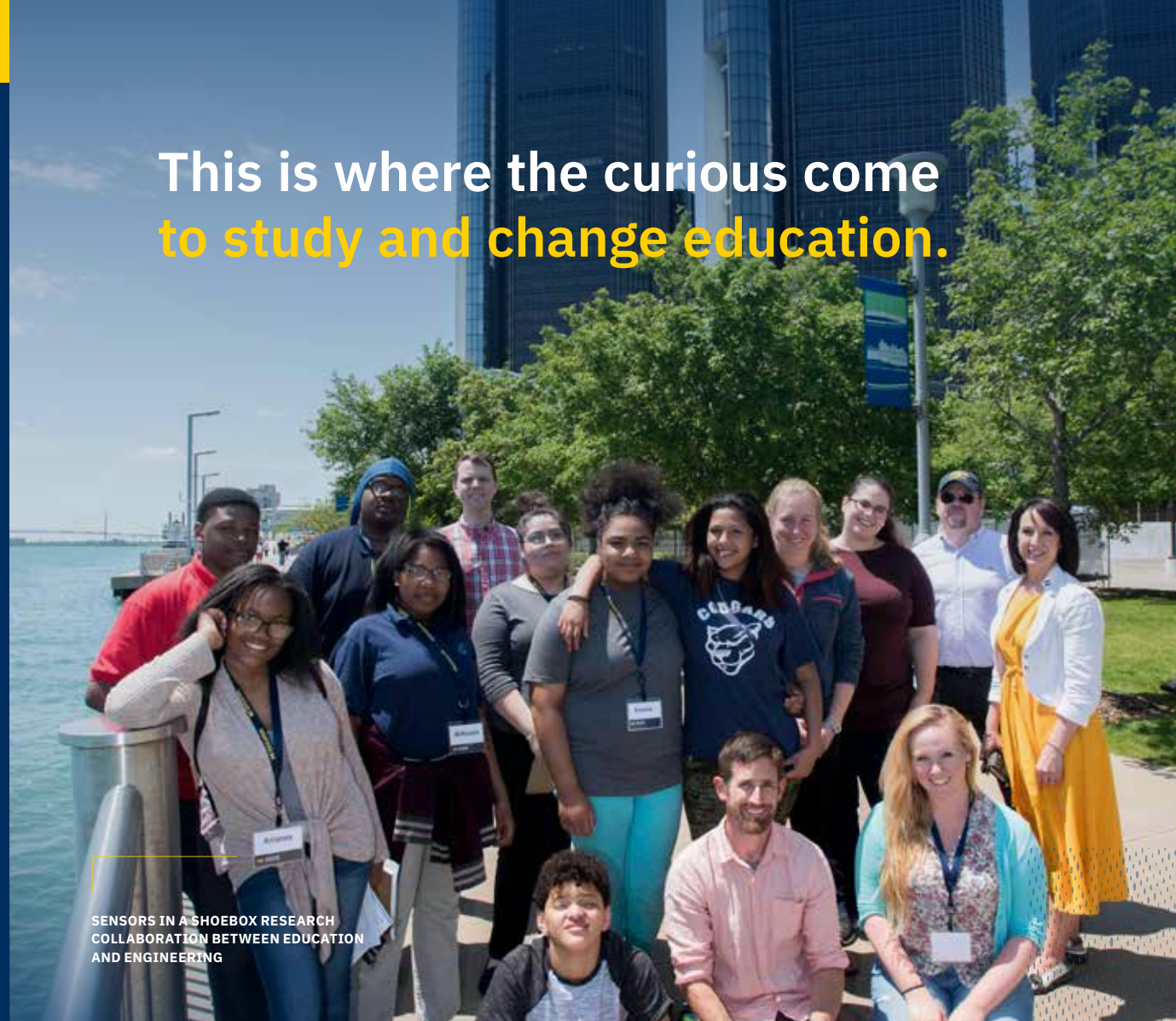
SENSORS IN A SHOEBOX RESEARCH COLLABORATION BETWEEN EDUCATION AND ENGINEERING

This is where the curious come to study and change education.