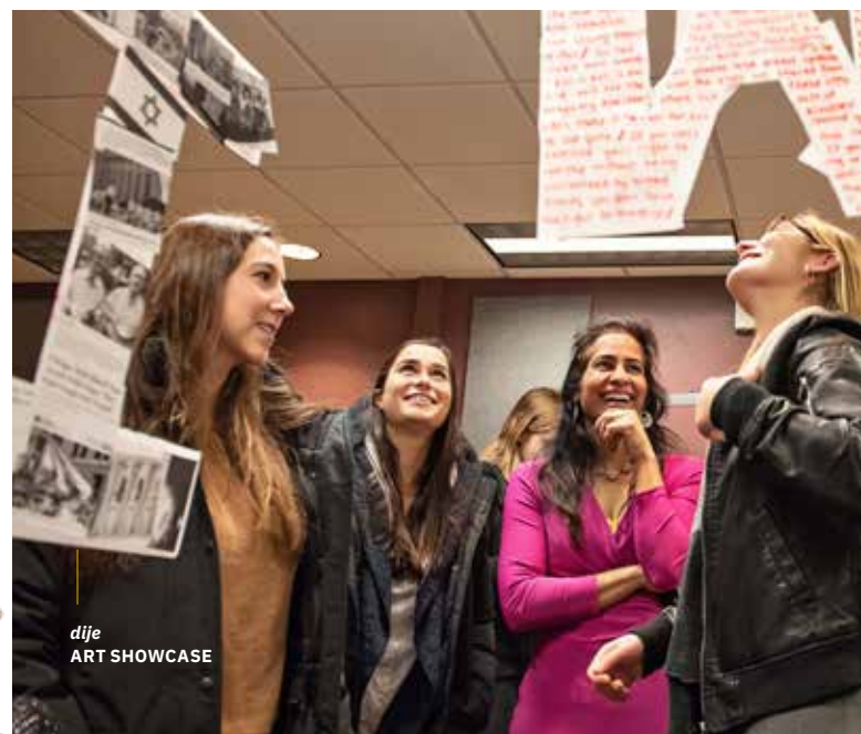
dije ART SHOWCASE