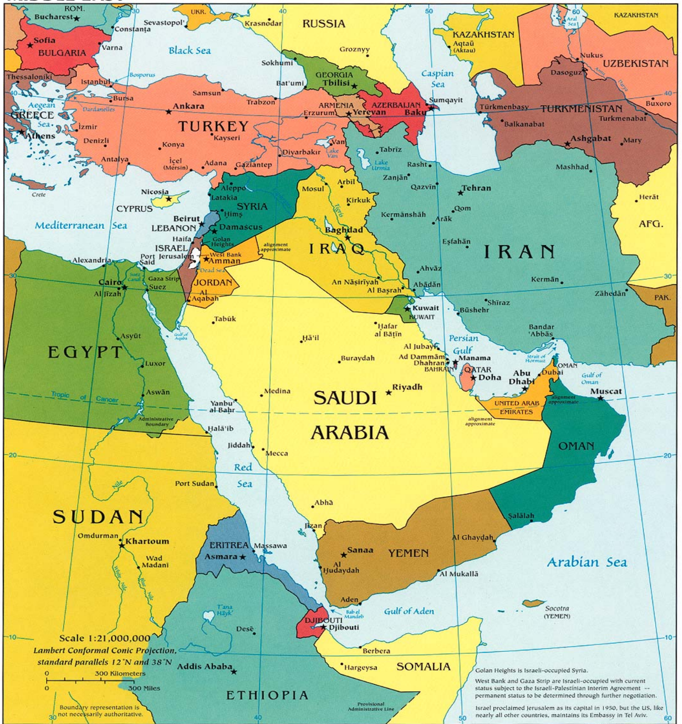
Map taken from University of Texas Perry-Castañeda Library Map Collection:

http://www.lib.utexas.edu/maps/middle_east_and_asia/middle_east_pol_2003.jpg